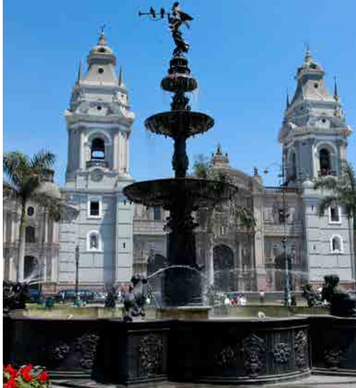
PLAZA DE ARMAS, LIMA, PERU

Recognized as the largest pre-Columbian city in the Americas and a UNESCO World Heritage Site, Chan Chan is a masterpiece of