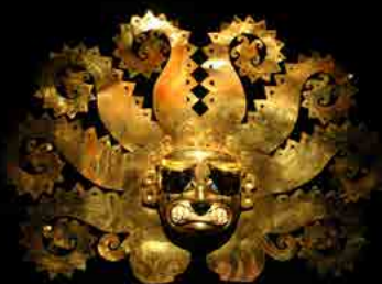
INCAN IDOL | ANCIENT MURAL IN THE HUACA DE LA LUNA IN TRUJILLO, PERU | INCAN MASK