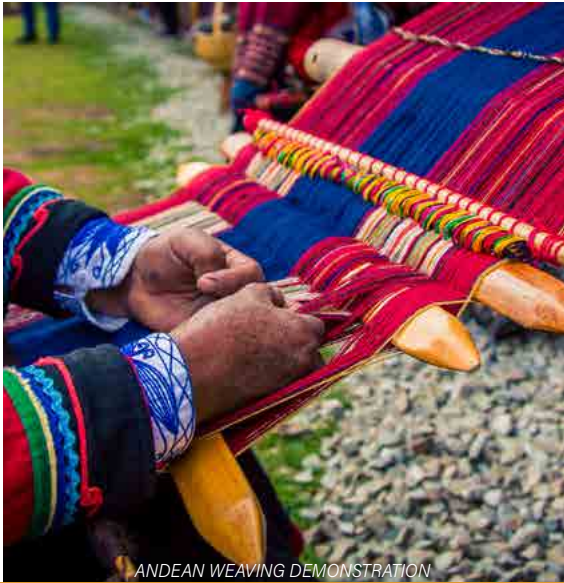
ANDEAN WEAVING DEMONSTRATION

Early this morning, choose between revisiting Machu Picchu along an alternate route for a fresh perspective or embarking on the exhilarating Huayna Picchu hike , offering breathtaking views of the surrounding landscapes. Enjoy lunch at a local restaurant , then head to the train station to board our train for a journey back to Ollantaytambo. Continue by motorcoach to Cuzco, with a stop in Chinchoero for a captivating Andean weaving demonstration led by Nilda Callañaupa, founder of the Center for