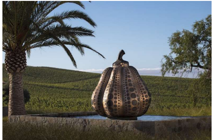
Zhan Wang, Artificial Rock No. 126, 2007–2013 & Yayoi Kusama, " Pumpkin," 2014 at The Donum Estate