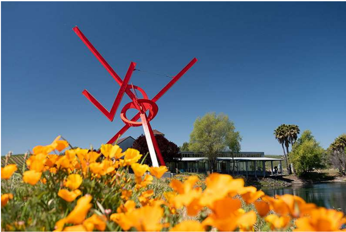
Di Rosa Center for Contemporary Art

and Tracey Emin, among many others. A wine tasting and light gourmet bites will be offered after touring the superlative estate in 4x4 all-terrain vehicles.