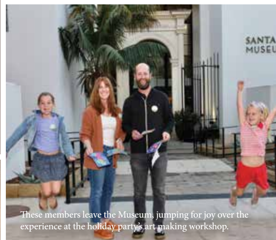
These members leave the Museum, jumping for joy over the experience at the holiday party's art making workshop.