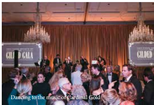
Dancing to the music of Cardinal Gold