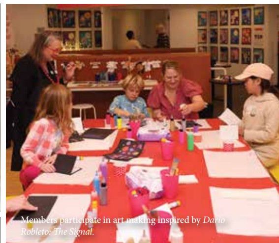
Members participate in art making inspired by Dario Robleto: The Signal .