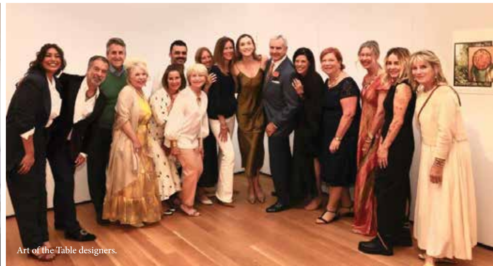
Art of the Table designers.