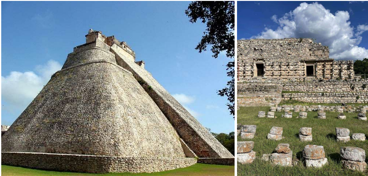
The ancient Maya city of Uxmal; stone carvings in Kabah along the Puuc Route

Chablé Yucatán, Chocholá (Breakfast, Lunch)