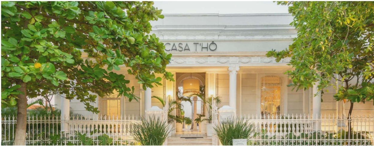
Casa T'Hō Concept House

In the evening, gather for a Welcome Dinner at Kuuk , where a tasting menu will introduce the enticing flavors and cuisine of the area.