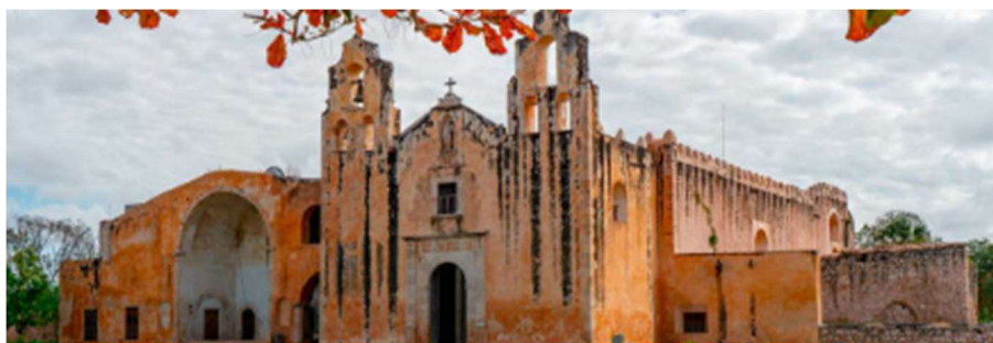
Cathedral in the village of Maní

Additional Notes: All arrangements are subject to change. Although SBMA and its suppliers will make every effort to adhere to the printed itinerary, on occasion it may be necessary to adjust arrangements because of circumstances beyond our control. Should an itinerary adjustment be necessary, substitution will be made to the best of our ability and additional costs necessitated by such changes may have to be covered by the tour member. If due to weather, flight schedules, or other uncontrollable factors, participants are required to spend any additional days or nights in the destination, they will be responsible for any additional expenses incurred, including hotel, transfers, and meal costs. Should you decide not to participate in certain parts of the program, or are for any reason prevented from joining parts of the tour, no refunds will be made for those unused parts of the program. There are no refunds if a portion of the tour is missed due to flight delays or cancellations. Depending on the situation, trip insurance may reimburse for missed portions of the tour. If a staff member is unable to participate, SBMA will make every effort to find a replacement with similar qualifications and no refunds will be made. The tour cost is based on a minimum of 15 participants and is subject to change due to tariffs or other changes. Aside from the deposit, tour payments should be made by check. SBMA’s California Seller of Travel License #: 209026