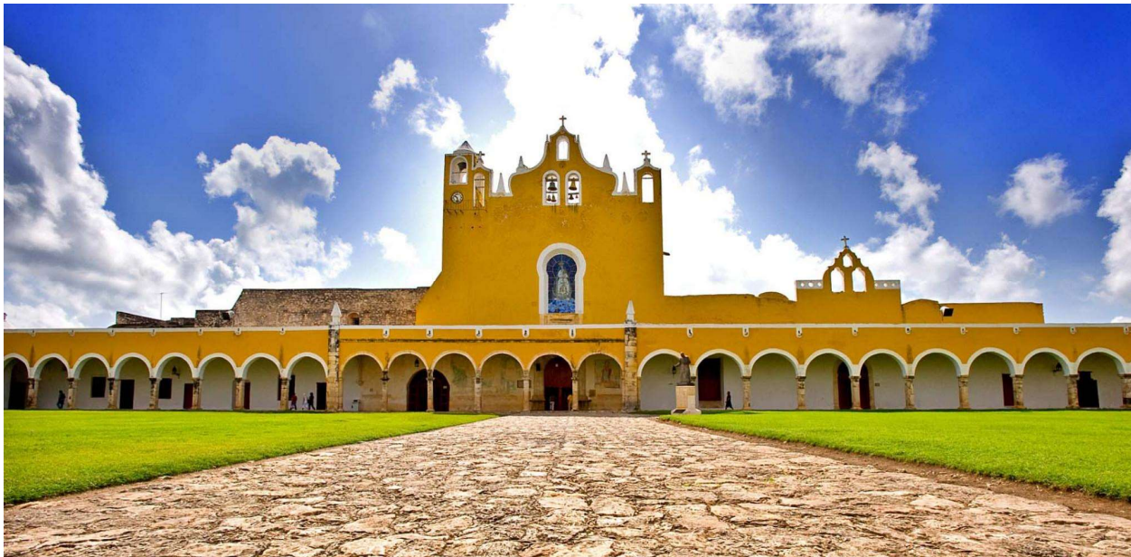
Convent of St. Anthony of Padua in Izamal, a town filled with bold yellow buildings