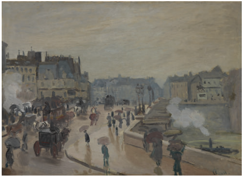
RIGHT: Claude Monet, The Pont Neuf , 1871. Oil on canvas. Dallas Museum of Art, The Wendy and Emery Reves Collection, 1985.R.38.