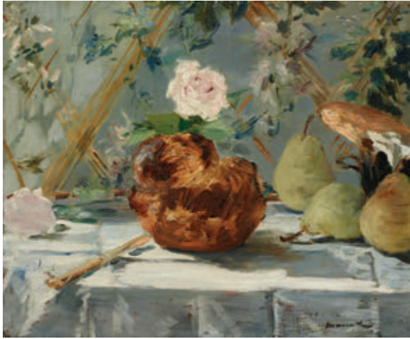
LEFT: Edouard Manet, Brioche with Pears , 1876. Oil on canvas. Dallas Museum of Art, gift of the Wendy and Emery Reves Foundation.