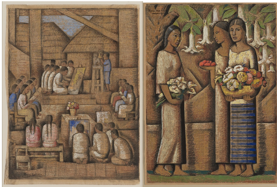
Left: Alfredo Ramos Martínez, La escuela (The School), 1937. Gouache, charcoal and watercolor on newsprint. SBMA, Gift of the P.D. McMillan Land Company, 1963.30. Right: Alfredo Ramos Martínez, Mujeres con flores (Women with Flowers), ca. 1946. Tempera and Conté crayon on newsprint. SBMA, Gift of the P.D. McMillan Land Company, 1963.32.1