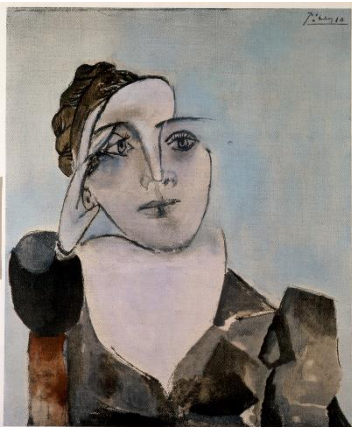
Pablo Picasso, Portrait of Dora Maar (Theodora Markovitch) , 1936. Lithograph. SBMA, Gift of Unknown Donor.

July 13, 2017 – Once again this summer, Atelier offers guests an evening of intimate, intriguing, occasionally irreverent interactions with art and artists in the Santa Barbara Museum of Art's galleries and Front Steps. Inspired by the current SBMA exhibition You Are Going On A Trip: Modern and Contemporary Prints from the Permanent Collection , this July 28th version takes the notion of travel and escape (mental or physical) and invites guests to "Get Out of Town" for a surreal summer vacation. Summer nights are longer, so Atelier extends its regular hours offering daylight savings diversions from 5:30 – 8:30 pm. Like all good experiences on the road, this one has motion, music, snacks, a little day dreaming and a great companion: art.