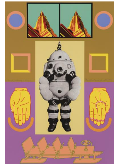
John Randolph Carter, Evidence of Swimming in Assyria , 1971. From the portfolio, Night Croquet . Photo screenprint. SBMA, Museum purchase, Dicken Fund, and Gift of the Artist.

In this nod to Warhol's "factory," an assembly line of Museum Teaching Artists speed sketch guests' portraits on giant plexi panels by scratching the lines through jewel-toned ink, then using the plexi as a plate, create a large scale mono-print that is installed on the gallery wall to dry. When the evening is over, collect your print and take it home.