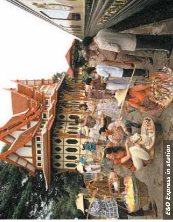
E&O Express in station