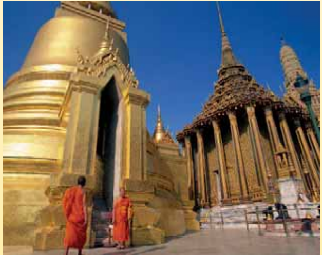
Above: Wat Phra, Grand Palace, Bangkok

Excursion: Ayutthaya. Take a leisurely cruise of the Chao Phraya River to Bang Pa-In, the extravagant royal Summer Palace surrounded by manicured gardens, and the ruins of Ayutthaya, the grand capital of Siam