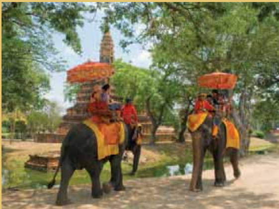
Above: Ayutthaya | Right: E&O Express

† Provided for Air Program participants only.