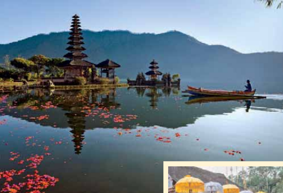
Left: Bali Below: Holy waters of Pura Tirta Empul