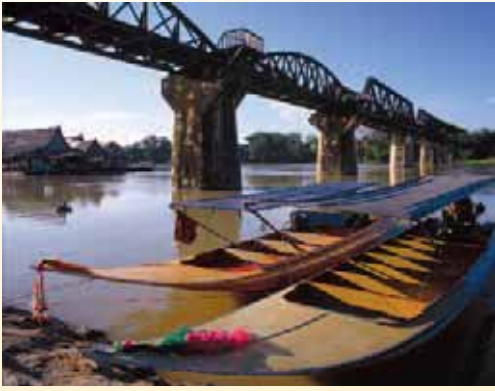
Below: Bridge over River Kwai Right: Ubudiah Mosque, Kuala Kangsar Lower right: Singapore

This afternoon, board the opulent Eastern & Oriental Express. As the train departs Bangkok, watch the cityscape fade into a lush rural tapestry.