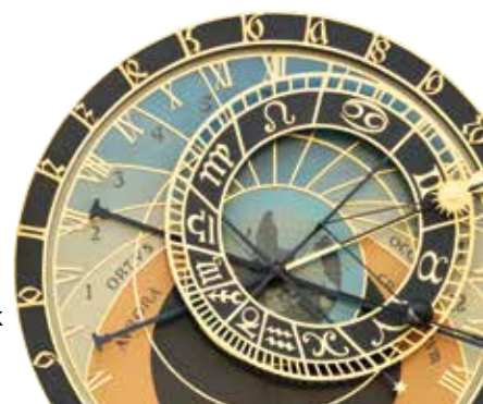
PRAGUE ASTRONOMICAL CLOCK

After breakfast, transfer to the Zurich airport for flights home. (B)