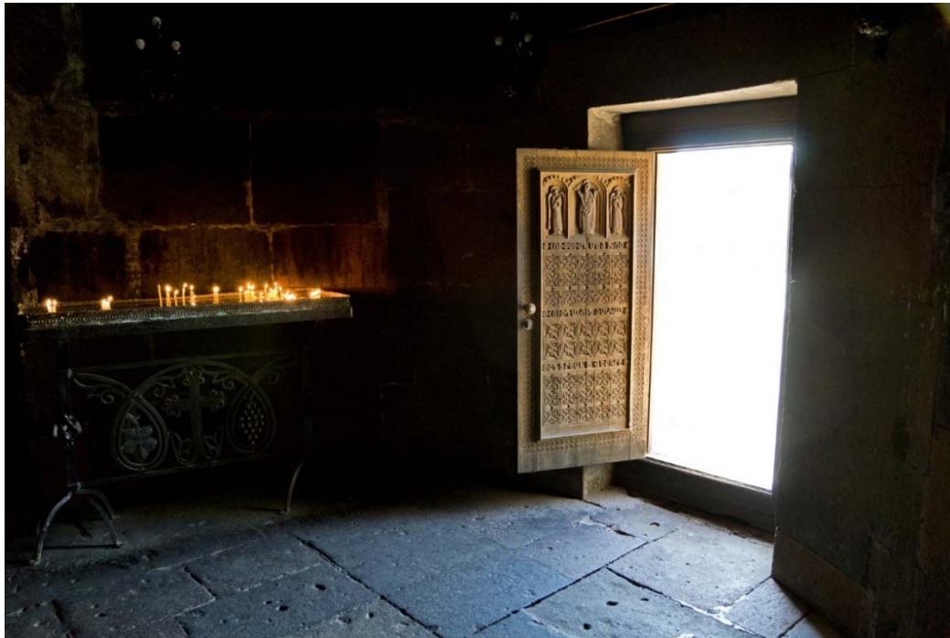
Saint Hripsime Church

May 31, Wednesday – DZORAGET to TBILISI (ARMENIA to GEORGIA)