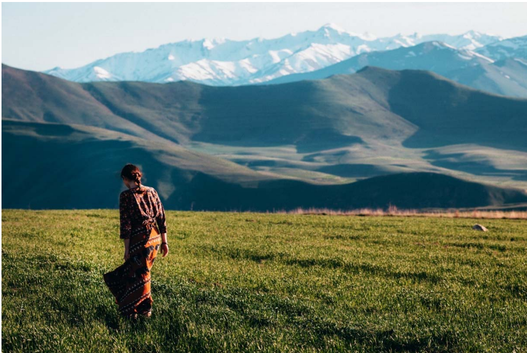
Armenian Woman in the Armenian Countryside