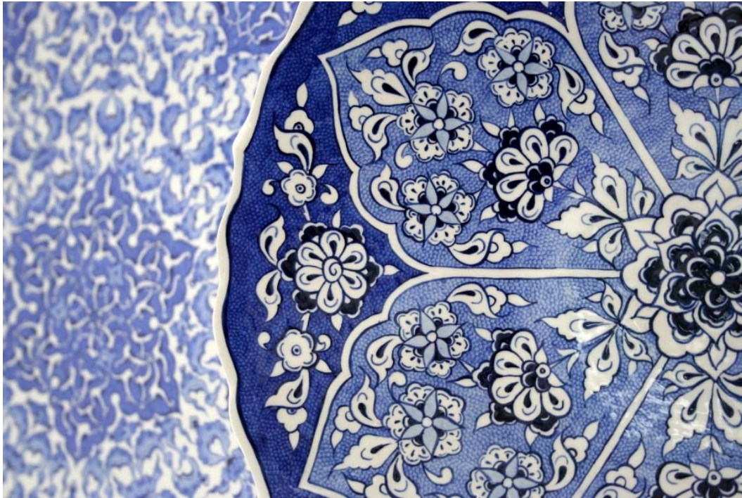
Kutahya-style ceramic arts

May 30, Tuesday – GYUMRI to DZORAGET, DEBED RIVER VALLEY