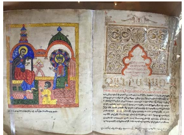
Museum of Ancient Manuscripts

Regroup to visit the Armenian Genocide Memorial & Museum and learn about this most seminal and tragic period of the country's history (1915). Depart Yerevan and drive about two hours northwest to the city of Gyumri , considered the country's creative capital with pottery studios and cute cafes at the foot of lofty black-and-apricot architecture. Although a devastating earthquake in 1988 destroyed Gyumri's Soviet-era buildings, many of the 19th-century buildings remained, due to their high-quality construction and materials. Check into Villa Kars, a boutique hotel in the heart of the historic district and have dinner this evening as a group. Villa Kars (B,D)