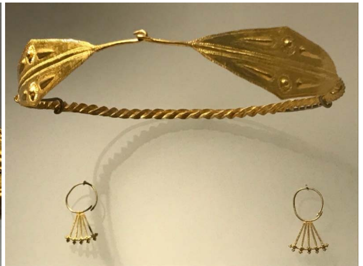
Gold jewelry on display at the Georgia National Museum