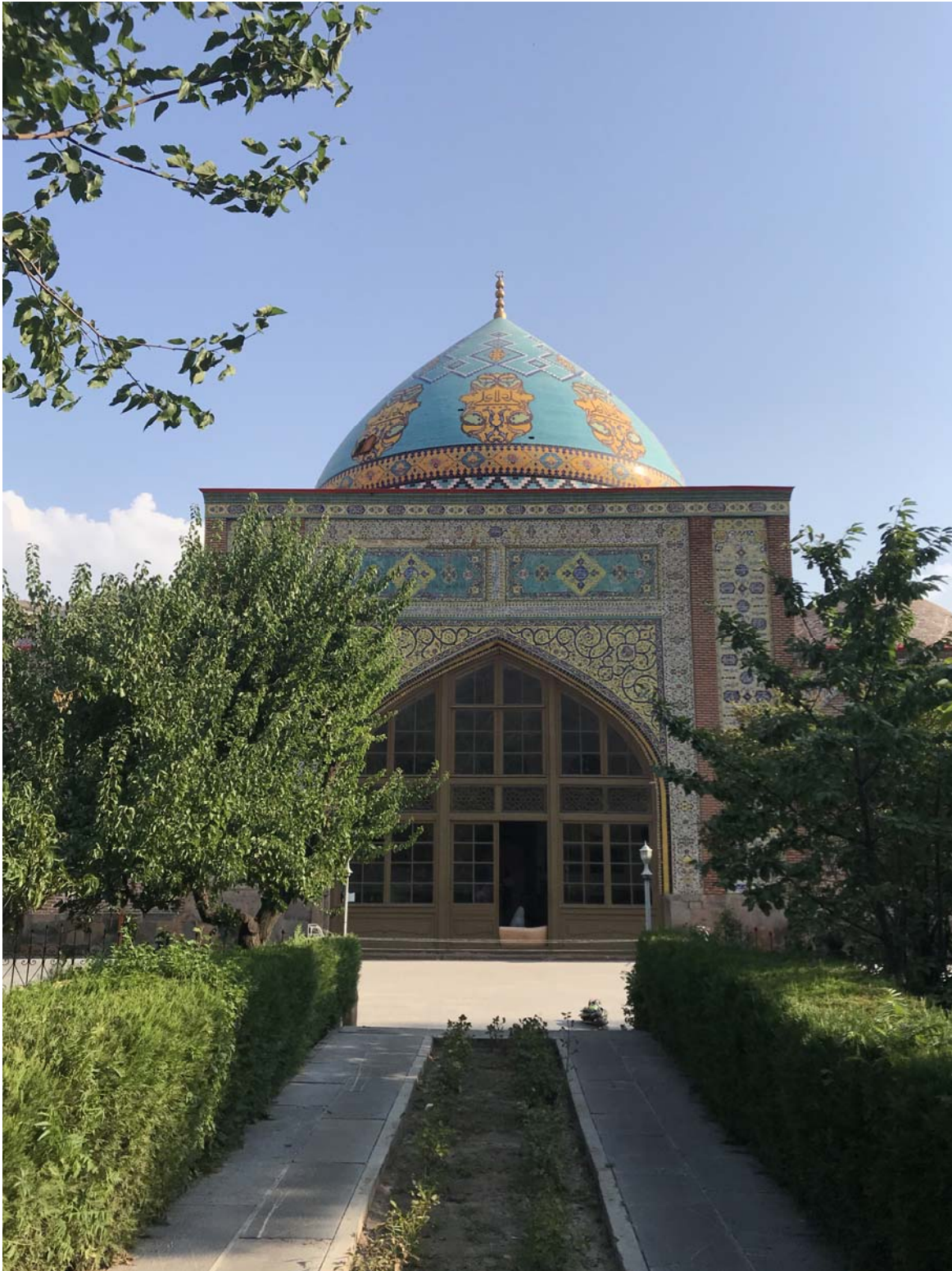
Blue Mosque, photo by Keelan Overton

Today will be divided between a morning day trip and an afternoon city tour . Drive east of Yerevan for about an hour to two of the country's UNESCO World Heritage sites: the 13 th -century Geghard monastery , portions of which are literally carved out of and into the adjacent rock, and the Garni temple , Armenia's only Roman-period site. Have lunch at a restaurant with spectacular views of the Garni temple and the dramatic Azat River valley below.