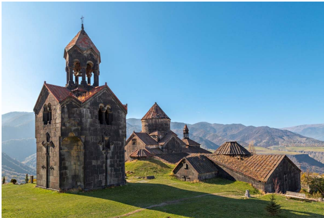
Haghpat Monastery and Church

Check out of the hotel and drive through the scenic Debed River Valley to Armenia's most remote northern monasteries, both of which are UNESCO World Heritage sites. The Haghpat monastery , from the 10 th to 13 th centuries, is set within lush rolling hills resembling Ireland or Scotland and is one of the most beautiful complexes in Armenia. The nearby Sanahin monastery is equally impressive and boasts extraordinary barrel vaulted halls of stone. Enjoy lunch at a mountainside restaurant with spectacular views of the Debed River Valley .