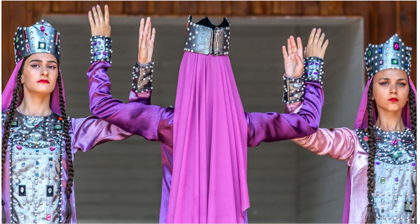
Dancers in traditional Georgian attire

Proceed to the Armenia-Georgia border , say goodbye to your Armenian national guide, and greet your Georgian national guide. Continue to Tbilisi, the capital of Georgia , and check into Hotel Ambassadors in the heart of the Old City . This evening, gather for our first dinner in Georgia accompanied by polyphonic singers and a Georgian folk show . Hotel Ambassadors, Old City (B,L,D)