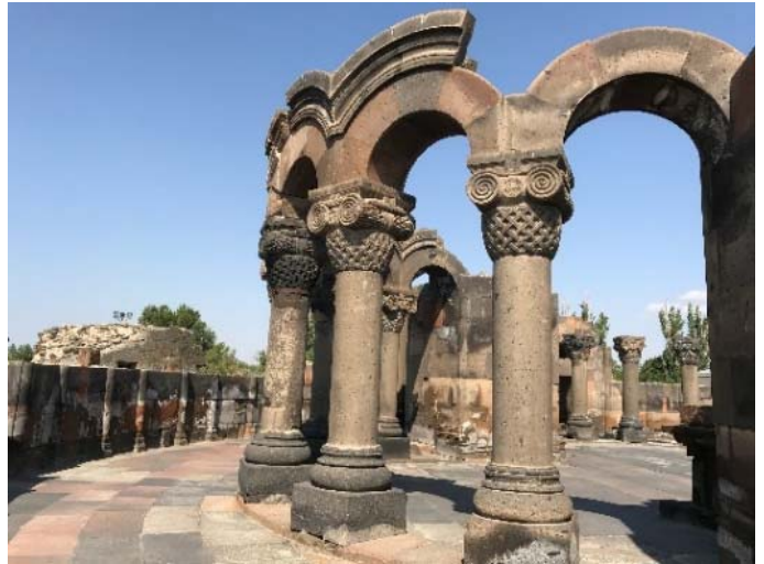
Zvartnots Cathedral, Keelan Overton

Spend the day visiting the spectacular sites dotting the landscape around Yerevan. Begin at the Khor Virap Monastery and soak in your closest view of snow-capped Mount Ararat (elevation 16,000 feet), Armenia's most sacred site, which is now located painfully across the border in Turkey. Proceed to the Mother See of Holy Etchmiadzin (UNESCO World Heritage), the home of the Armenian Apostolic Church . The cathedral itself is closed for renovations, but we have more than enough to see with the expansive grounds and museums, which lent many key objects to the Metropolitan Museum of Art's 2018-19 groundbreaking exhibition, Armenia!