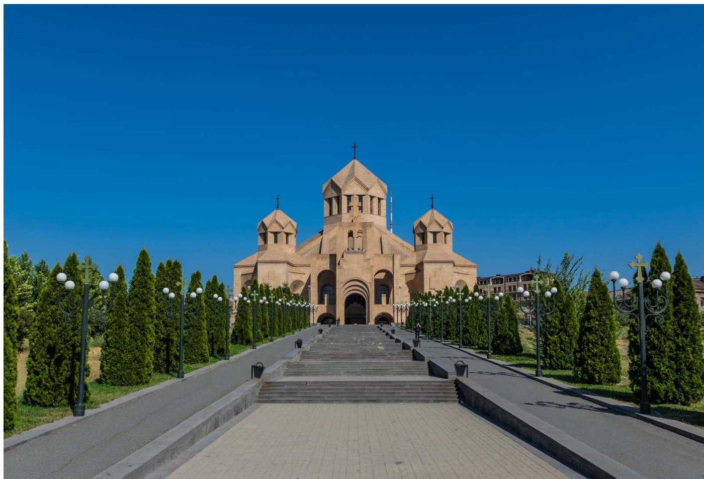
Cathedral in Yerevan

May 22 to May 24, Monday to Wednesday – U.S. to YEREVAN