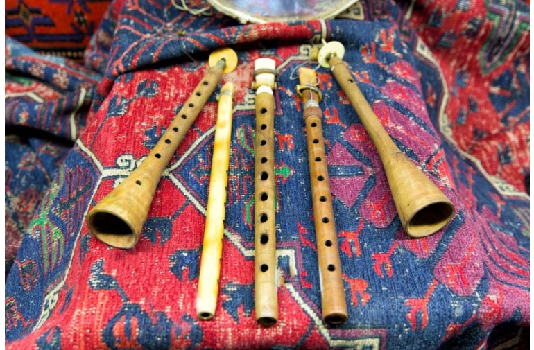
Traditional duduk instrument

Return to Yerevan to see the 18 th -century Blue Mosque , so called because of its Persian-style blue tiles, and learn about Yerevan's Persian and Muslim past, as well as its more recent "tile diplomacy" with nearby Iran. Briefly visit the Pak Shuka market across the street and continue to Kond (meaning "long hill") , Yerevan's oldest neighborhood , where we will walk the quiet and generally unvisited streets and discuss the future of Kond and its critical preservation with a local specialist (subject to confirmation). End the day with a duduk (wind instrument) demonstration . Dinner is at leisure. The Alexander (B,L)