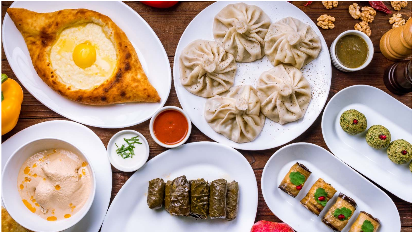
Georgian cuisine: khachapuri , khinkali , pkhali , dolma , satsivi