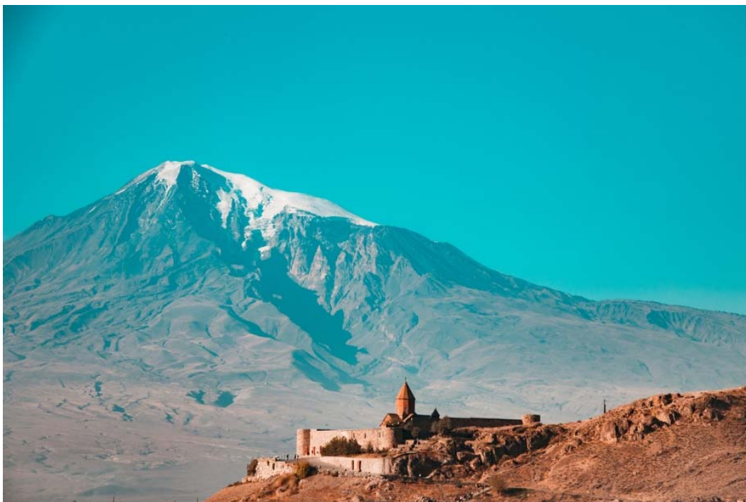
Khor Virap Monastery and Mount Ararat

A group dinner (with a local preservation specialist as our guest, schedule permitting) will be at Derian or one of the city's many up and coming restaurants, where you will also sample the country's famous flatbread ( lavash ). The Alexander (B,L,D)