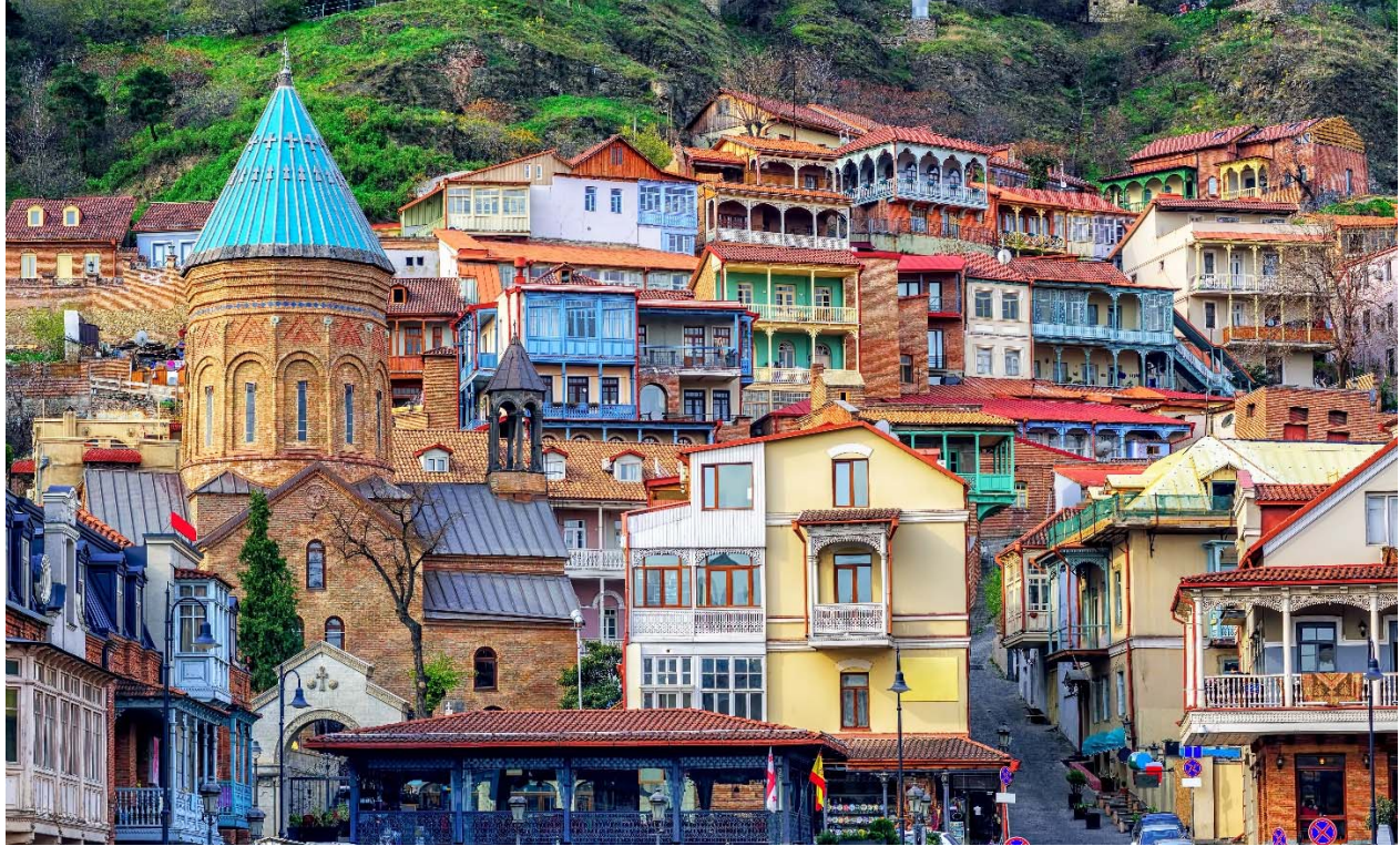
The Old Town of Tbilisi, Georgia