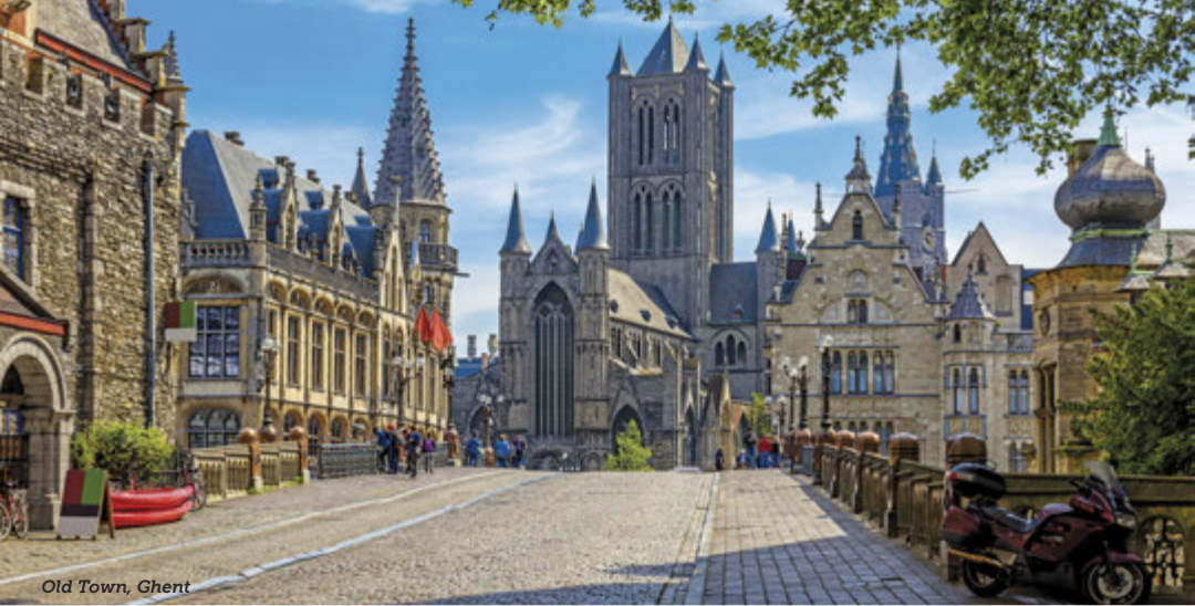
Old Town, Ghent