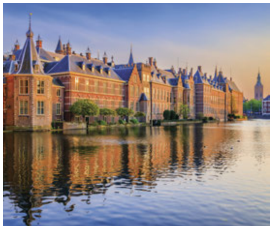
Below: The Hague

introduced cocoa beans to Belgium. Discover more about chocolate making at a chocolatier's shop and indulge in a sweet sample. (Active)