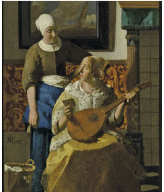
Top: Amsterdam | Above: Detail of "The Love Letter," Special Vermeer Exhibition, Rijksmuseum

• Bruges and Beer. Tour the family-owned