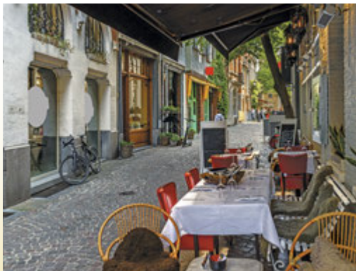
Old Town, Antwerp

🍷 Elective experiences available at an additional cost.