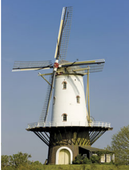
Left: Windmill, Veere