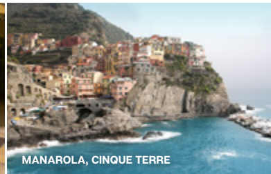
MANAROLA, CINQUE TERRE