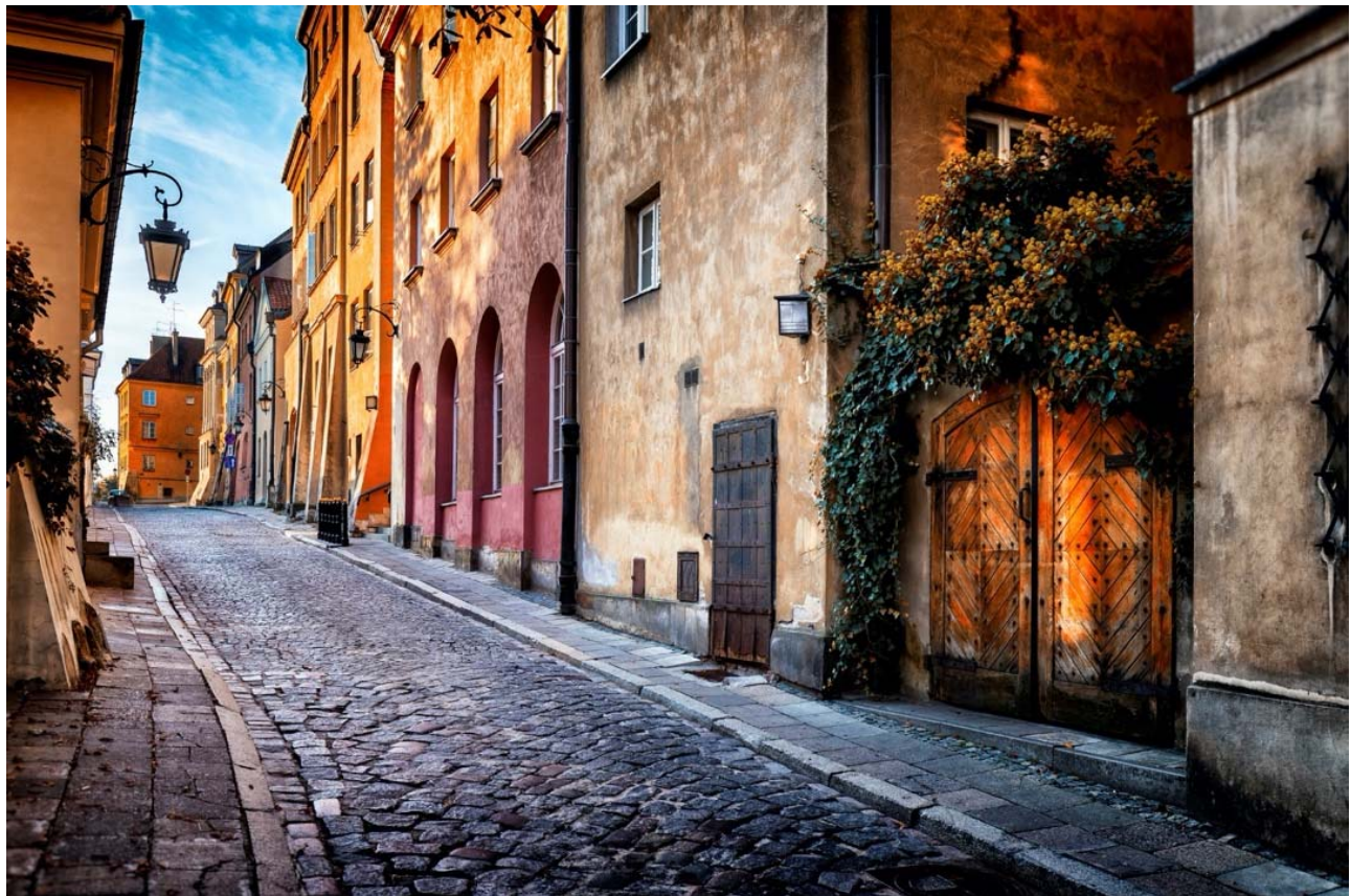
Autumn view of the birch street in the morning in Warsaw's Old Town, Poland

Visit Auschwitz today. Although the Nazis tried concealing their worst atrocities at Poland's first concentration camp, evidence remains among the site's more than 40 red brick buildings. View footage of Poland during World War II, then pass through the gateway inscribed with the infamous words, "Work Makes Freedom." Witness powerful exhibits and inmates' stark living quarters. Continue to Birkenau, known as Auschwitz II , a 400-acre site that held 100,000 prisoners. Lunch will be at a local restaurant. After returning to Kraków, dinner is independent. Hotel Unicus Palace (B,L)