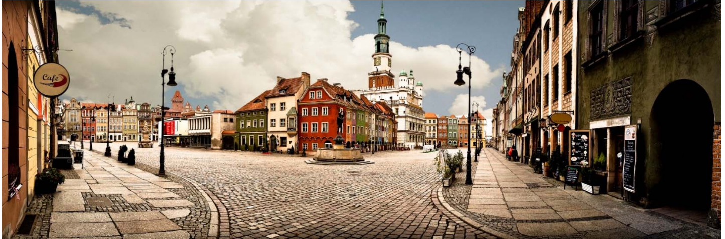
Market place in the center of Poznań in Poland