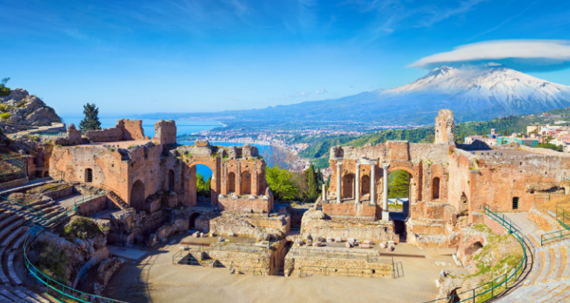
Amphitheater of Taormina