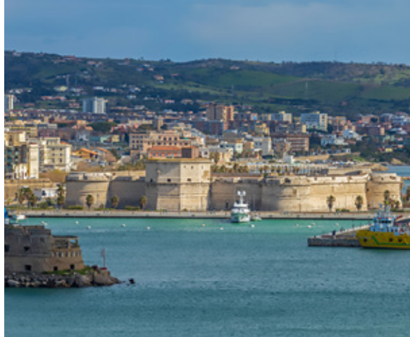
Harbor of Civitavecchia