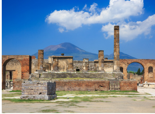
Pompeii and Mount Vesuvius