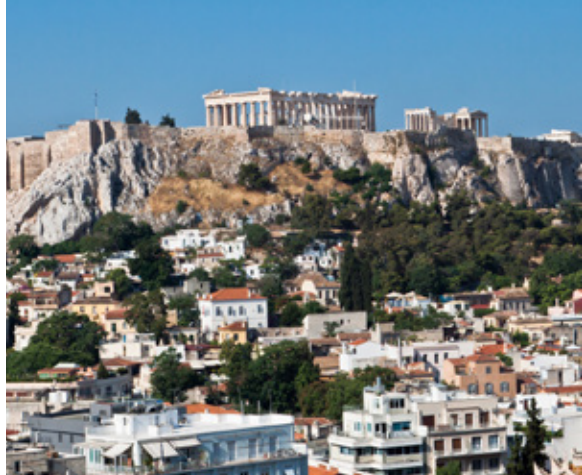
The ancient Plaka below the Acropolis in Athens