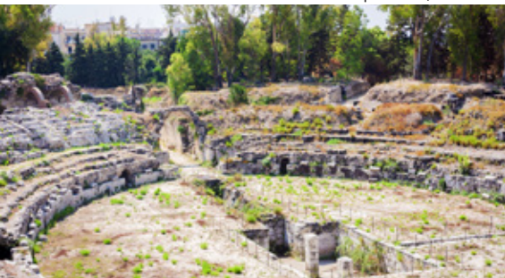
Roman Amphitheater, Siracusa

Disembark this morning and transfer to the airport for flights home or begin the optional post-tour extension in Rome. (B)