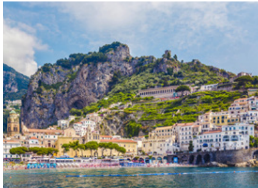
Sorrento, Amalfi Coast