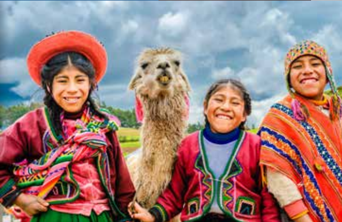
CHILDREN WITH THEIR LLAMA, CUSCO; OLLANTAYTAMBO

Visit the UNESCO World Heritage site of Cusco, the oldest continually inhabited city in the Western Hemisphere.