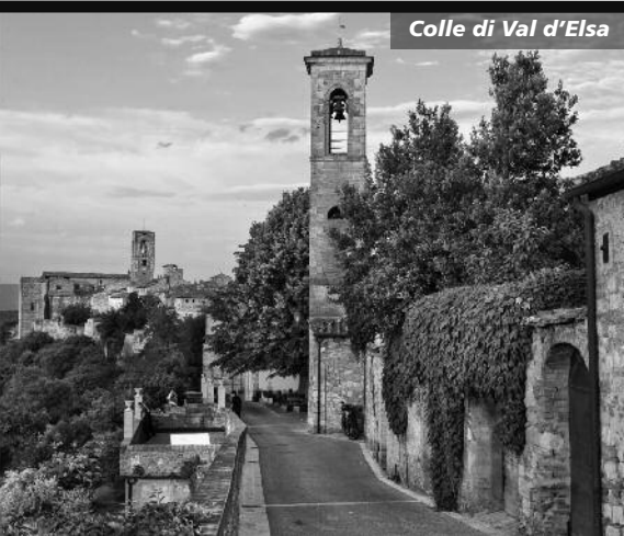
Colle di Val d'Elsa

uscany is one of the world's most beloved destinations, and for good reason: The wine, food, historic landmarks and art are second to none. Step off the beaten path and experience Tuscany as few travelers have before. On this unique journey, linger in medieval villages, sip Chianti among the rolling hills, nibble nutty Pecorino at a family farm and glean tips from a Tuscan chef at work in the kitchen. Immerse yourself in the Tuscan way of life and feast your eyes on both world-famous landmarks and hidden gems, from Florence's iconic Ponte Vecchio to the quintessential Tuscan town of Cortona.