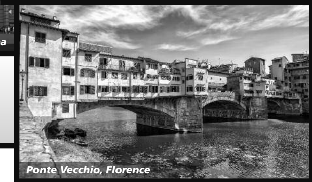
Ponte Vecchio, Florence

through a discussion with local residents.