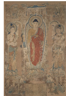
Miraculous Image of Liangzhou (Fanhe Buddha), ca. 700s CE