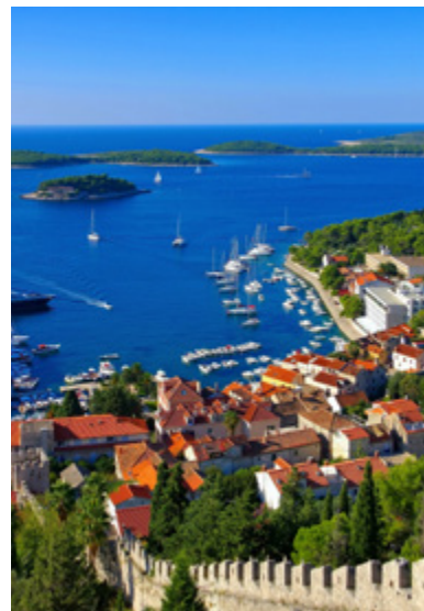
PHOTO CREDITS: Dubrovnik Rooftops © Nikolai Sorokin; Pula © Phant; Dragon Statue © Svetlana Leybova; Ljubljana © Kasto80; Lake Bled © Andrey Rodionov; Split © Daliu80; Krka NP © Pmartke; Zadar © Dreamer4787; Dubrovnik Bay © Dreamer4787; Emperor Diocletian © Oleg Bannikov