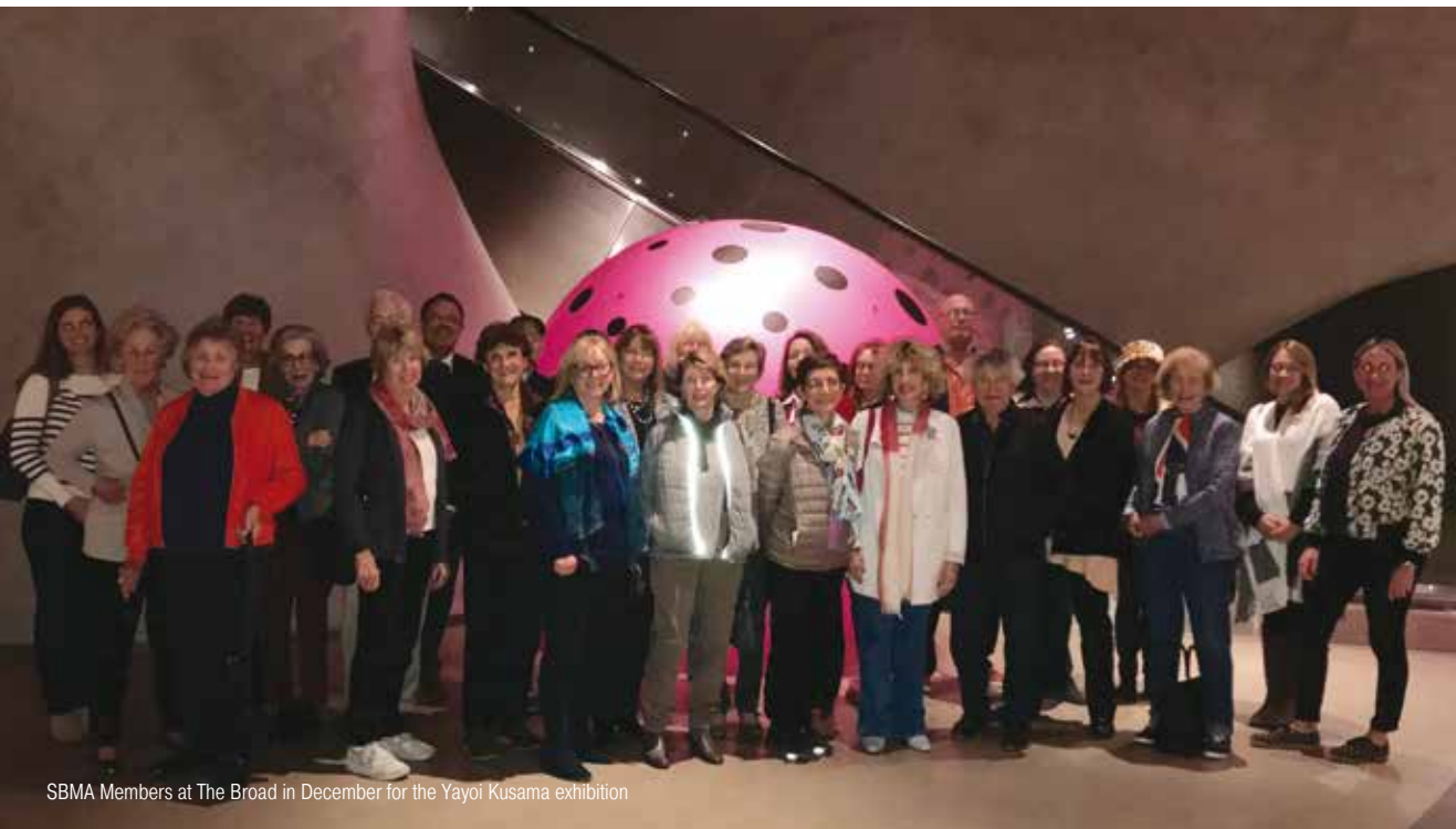
SBMA Members at The Broad in December for the Yayoi Kusama exhibition