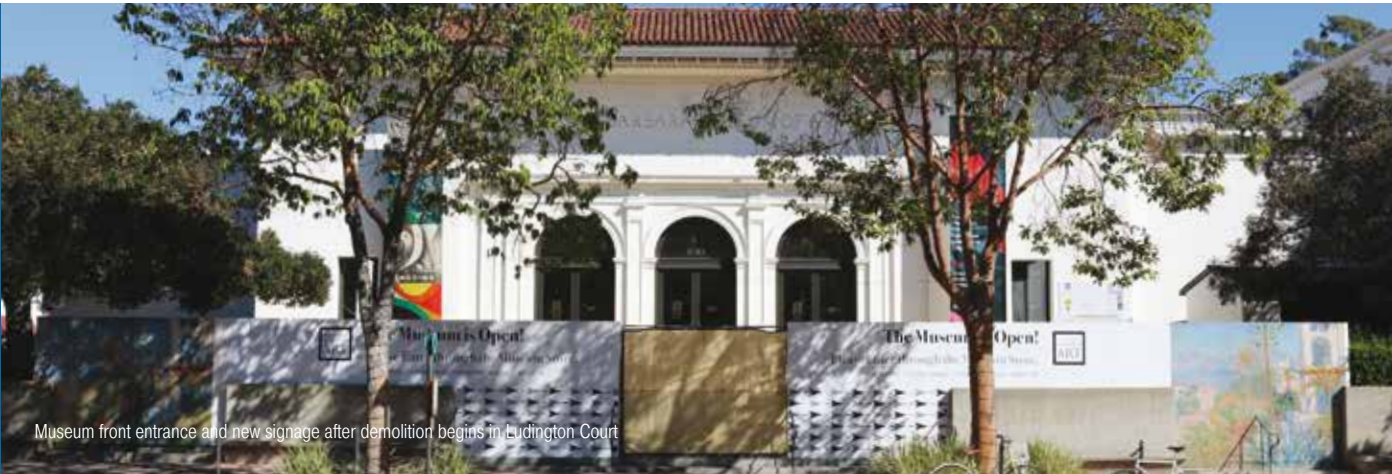
Museum front entrance and new signage after demolition begins in Ludington Court

The Zegar Family Foundation has provided a grant of $600,000 to the Santa Barbara Museum of Art's Imagine More Capital Campaign, in support of the current renovation project. The renovation will produce three new galleries for the permanent collection and 25 percent more space to showcase some of the world's most engaging artistic achievements, spanning from ancient China to contemporary California. Keeping with the vision of its founders, the Museum seeks to expand the scope of its exhibitions, programs, and place as a public forum for the arts in Santa Barbara. The Museum thanks the Zegar Family Foundation for supporting this vision and for this generous commitment of helping maintain and sustain SBMA for the community today, and in the future.