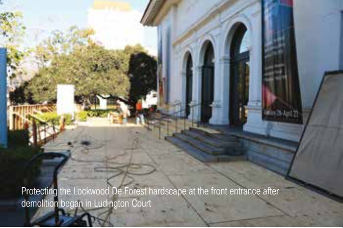
Protecting the Lockwood De Forest hardscape at the front entrance after demolition began in Ludington Court

The Zegar Family Foundation has provided a grant of $600,000 to the Santa Barbara Museum of Art's Imagine More Capital Campaign, in support of the current renovation project. The renovation will produce three new galleries for the permanent collection and 25 percent more space to showcase some of the world's most engaging artistic achievements, spanning from ancient China to contemporary California. Keeping with the vision of its founders, the Museum seeks to expand the scope of its exhibitions, programs, and place as a public forum for the arts in Santa Barbara. The Museum thanks the Zegar Family Foundation for supporting this vision and for this generous commitment of helping maintain and sustain SBMA for the community today, and in the future.