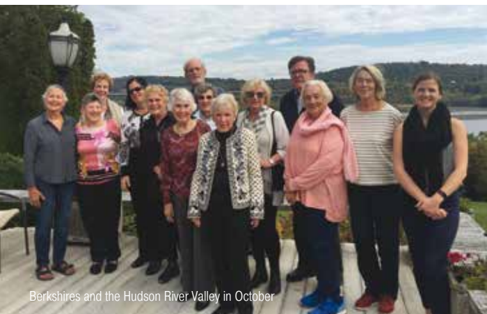
Berkshires and the Hudson River Valley in October