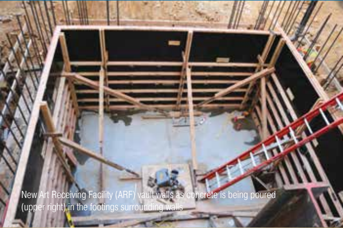
New Art Receiving Facility (ARF) vault walls as concrete is being poured (upper right) in the footings surrounding walls