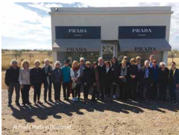
At Prada Marfa in November