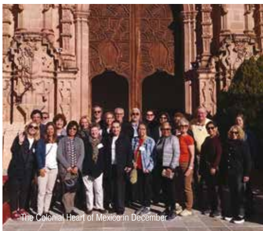
The Colonial Heart of Mexico in December