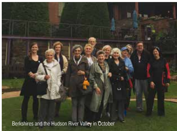
Berkshires and the Hudson River Valley in October