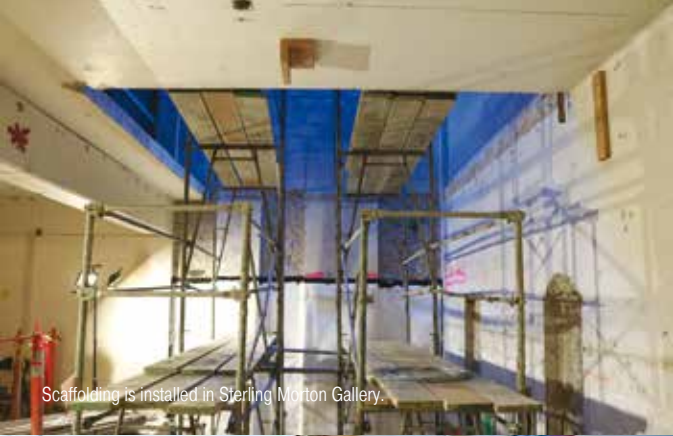
Scaffolding is installed in Sterling Morton Gallery.