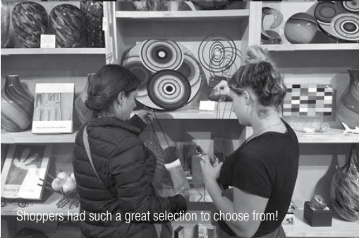
Shoppers had such a great selection to choose from!