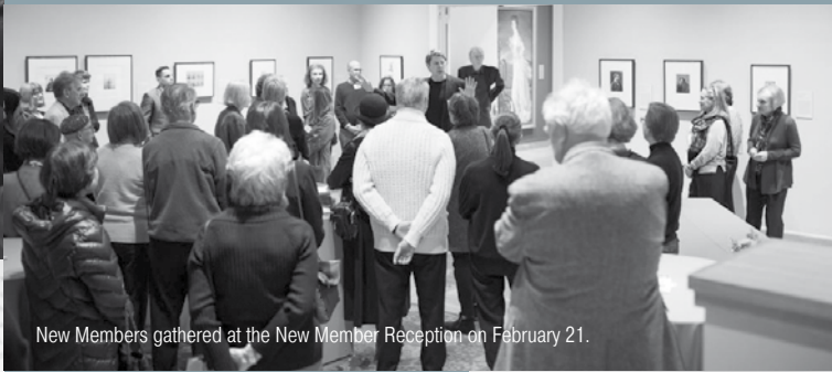
New Members gathered at the New Member Reception on February 21.