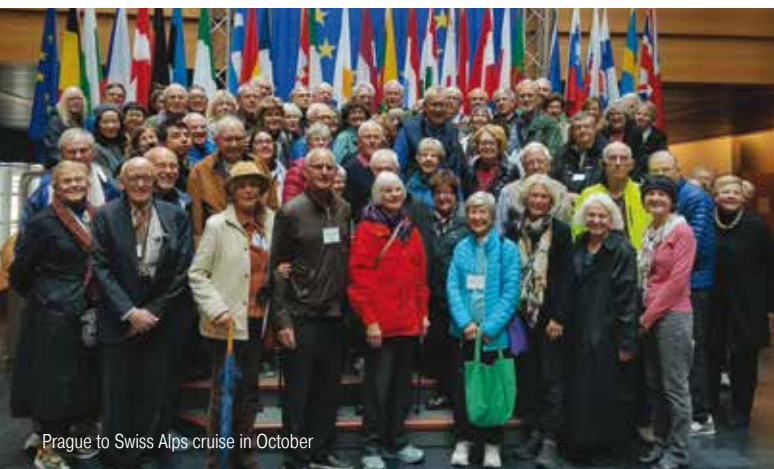
Prague to Swiss Alps cruise in October