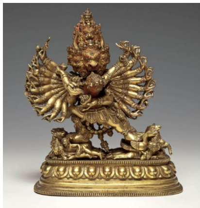
Image: Vajrabhairava Embracing Consort , Tibetan, late 17th century. Gilded bronze with traces of paint. SBMA, Museum Purchase with the John and Peggy Maximus Fund.