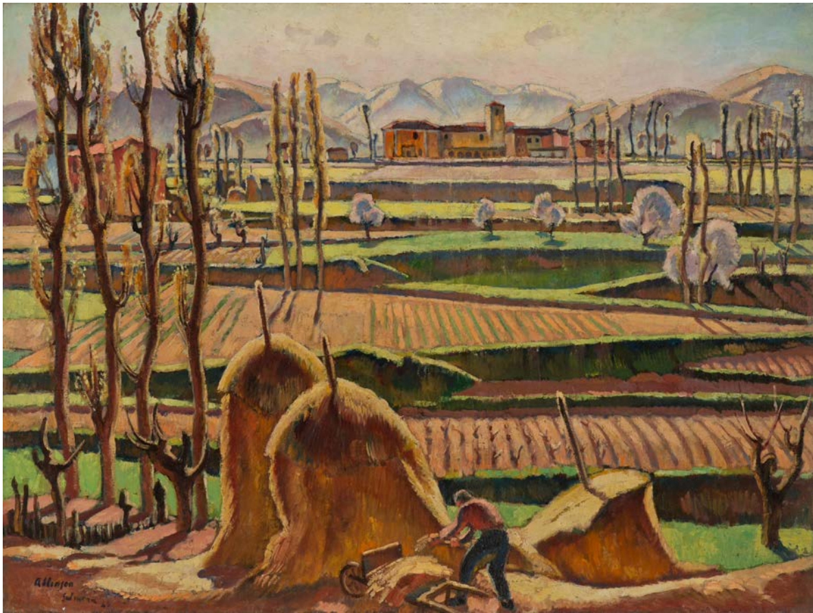
A painting displayed at Santa Barbara Museum of Arts (Photo: Santa Barbara Museum of Arts)