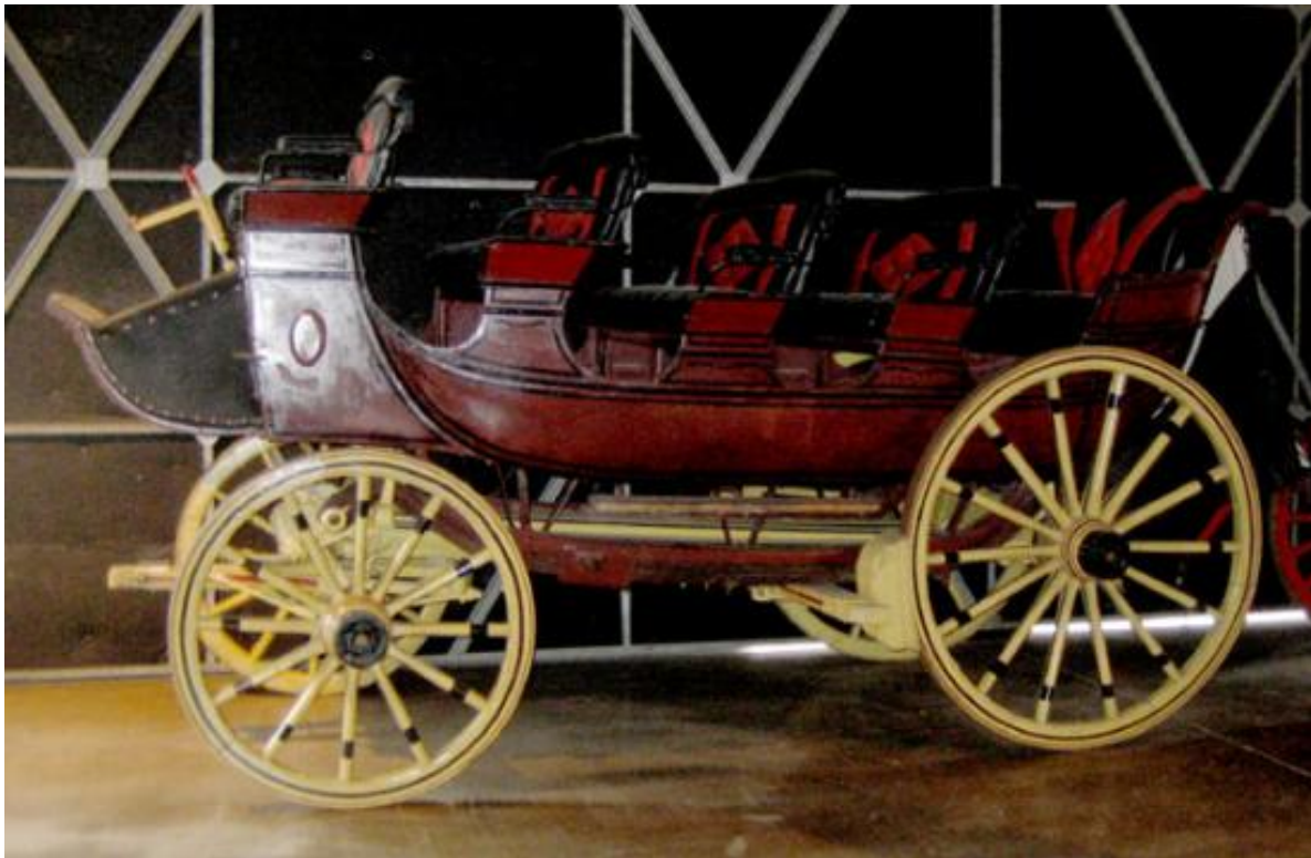
An antiquated carriage at the Carriage and Western Art Museum