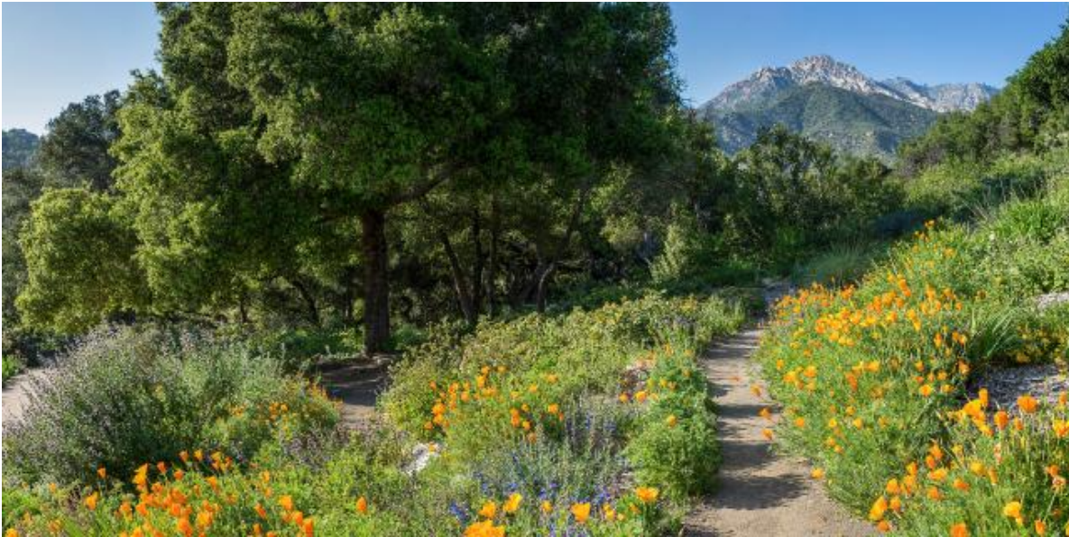
A lush green landscape at Santa Barbara Botanic Gardens