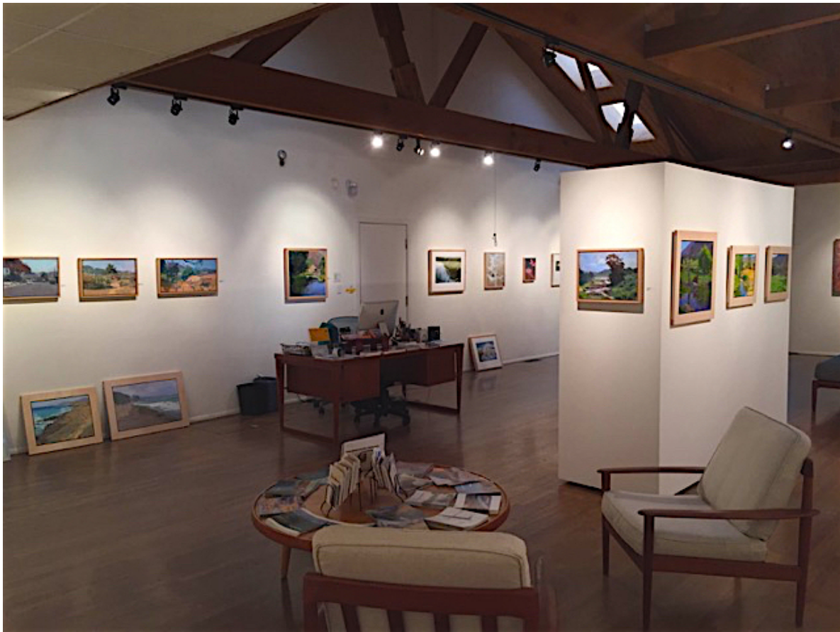
Wall art at the Marcia Burt Gallery