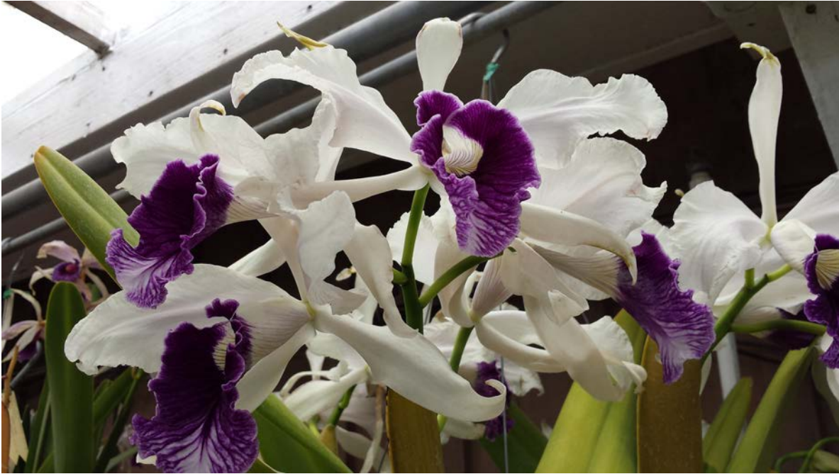
Colourful orchid plants at the Santa Barbara Orchid Estate

Visitors are able to wander around the five acre estate or purchase orchids that have been especially grown in this area, which is renowned for its perfect growing conditions.