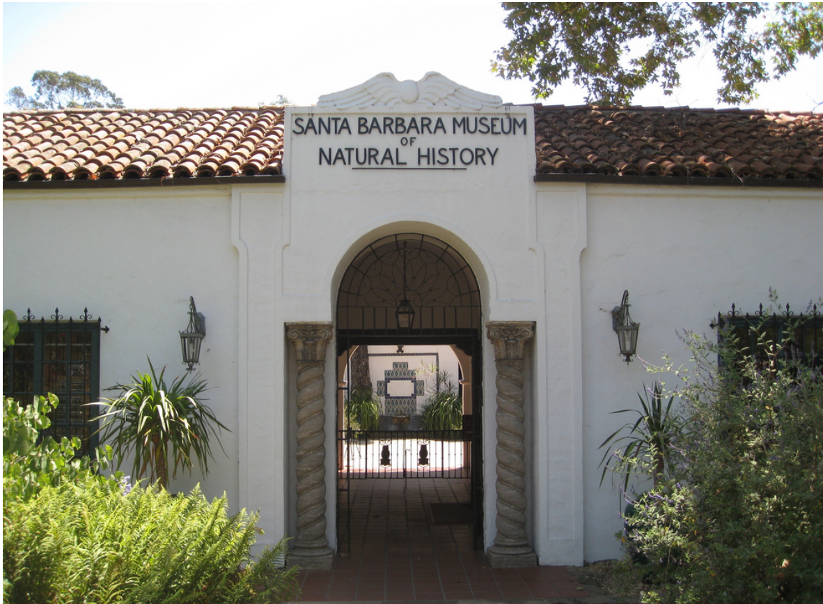
The exterior of the Santa Barbara Museum of Natural History

Opened in 1916, the Natural History Museum is the oldest museum in Santa Barbara. Legend has it that Albert Einstein visited the museum in 1931 and remarked that, "I can see that this museum has been built by the work of love". With ten exhibition halls, the museum is known for its displays showcasing wildlife indigenous to Southern California. In particular, the museum features an exhibition focussed on the story of the California Condor, which explains why this majestic bird is classed as 'critically endangered' and what is being done to save it.