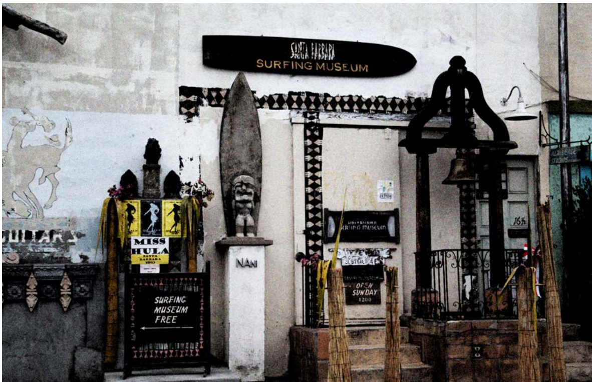
Historic surfing memorabilia at the Santa Barbara Surfing Museum