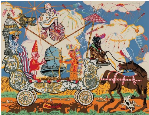
Red Grooms, Bicentennial Bandwagon , 1970s. From the portfolio, “Spirit of Independence, Kent Bicentennial.” Serigraph. SBMA. Gift of Lorillard Company.

They present new considerations of well-known people and stories and revisit historical events. They confront desires and goals and sometimes lead to an expansion of our definitions of art.”