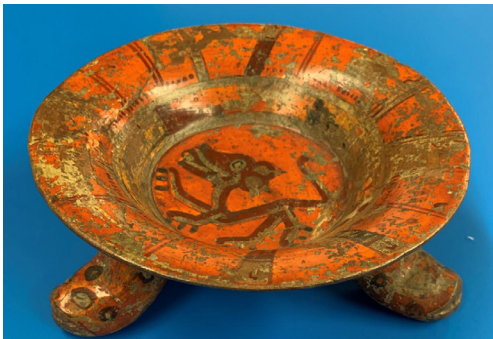
Cat, Mexico, about 500-700 years old, terracotta with slip paint.