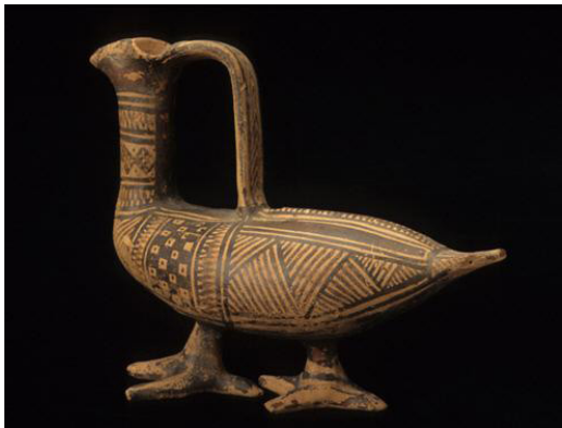
Bird, Greece, about 2800 years old, ceramic.