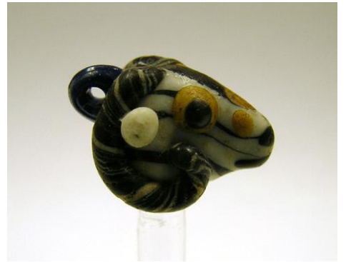
Ram, Eastern Mediterranean, about 2500 years old, glass.