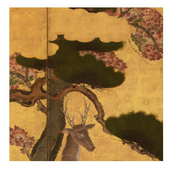
A spotted deer under the arch of a tree