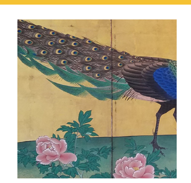
Two proud peacocks

Go on a scavenger hunt to find the items below, using the image details as your guide. When you have found all these things, return to the Visitor Services desk to claim your prize. With it, you can design your own miniature screen at home to help you remember your visit today. What season, animal, tree, or story will you include?