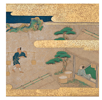
Baskets of salt