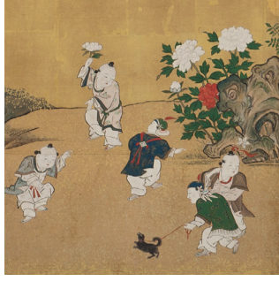
Children at play, walking a dog