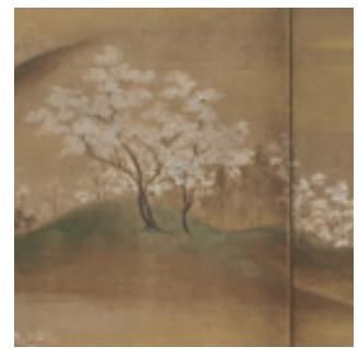
Cherry blossoms on a hillside