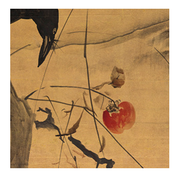
A persimmon being watched by a nearby crow